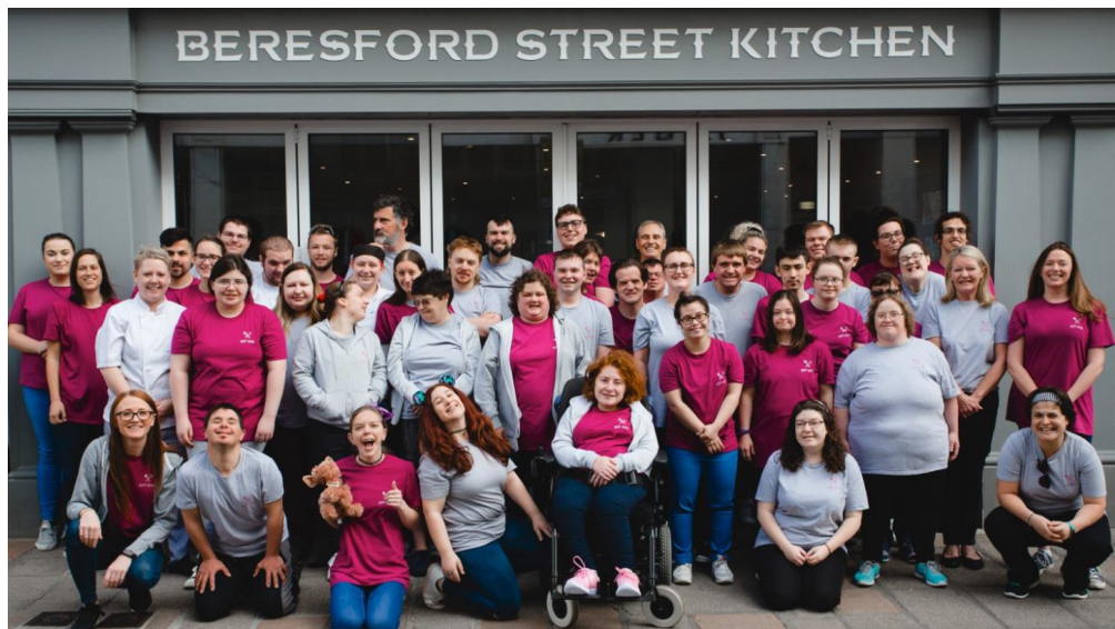
The Beresford Street Kitchen Team

Beresford Street Kitchen (BSK) is a social enterprise providing education, training, and employment for people with learning disabilities and/or autism. BSK has four main areas: Beresford Street Kitchen, La Hogue Bie Tearooms, BSK Catering, and BSK Print Works.